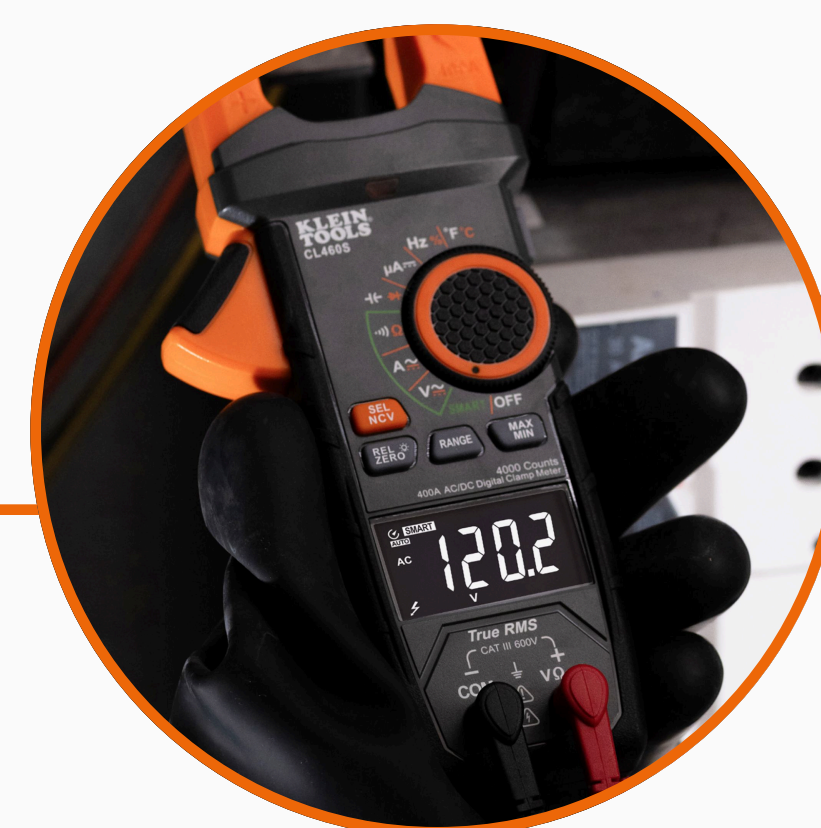
Reverse Contrast Display Visible in Any Light

Same TRMS Accuracy in SMART or traditional dial-turned mode