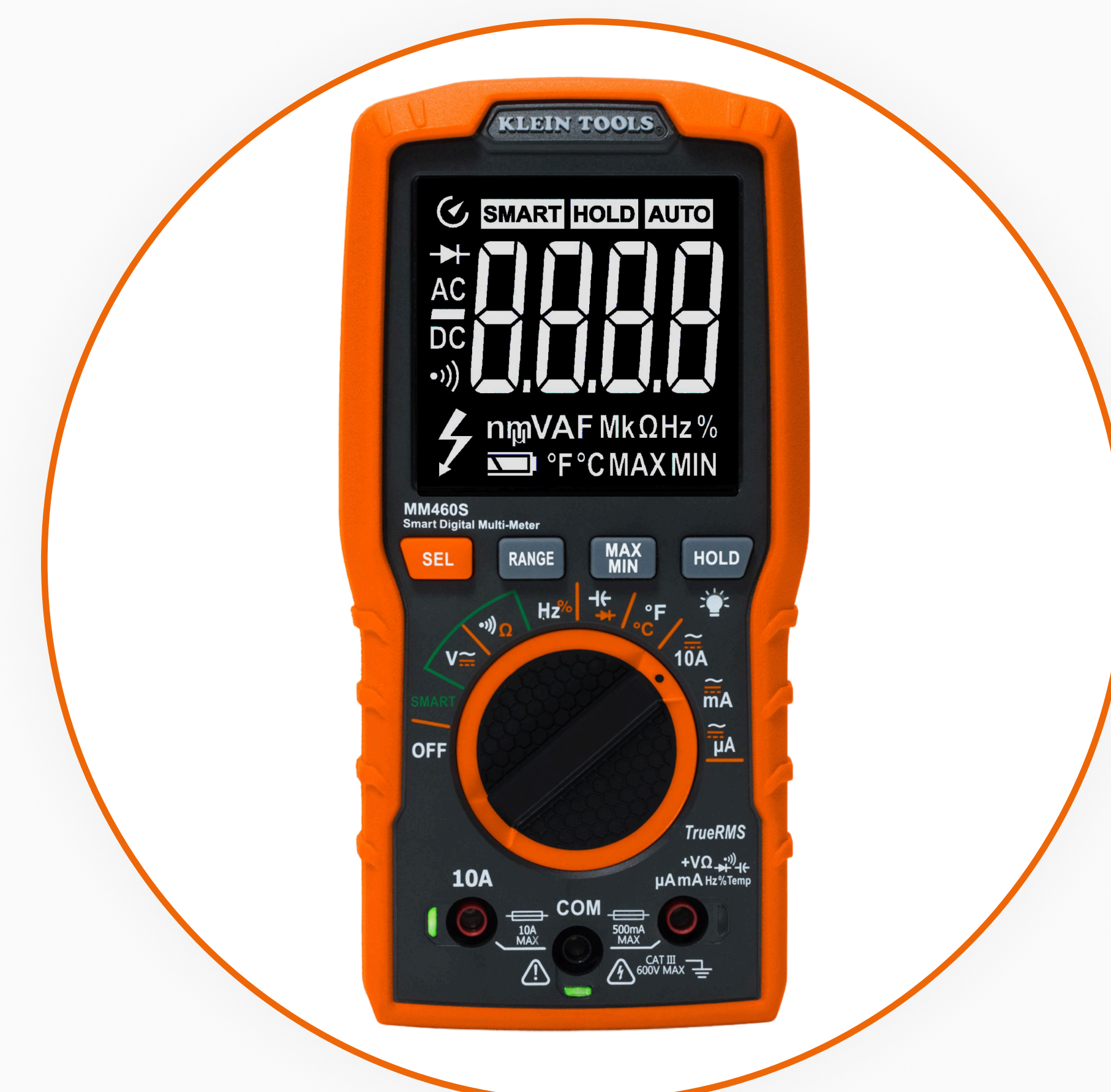
Also Available MM460S Smart Digital Multimeter