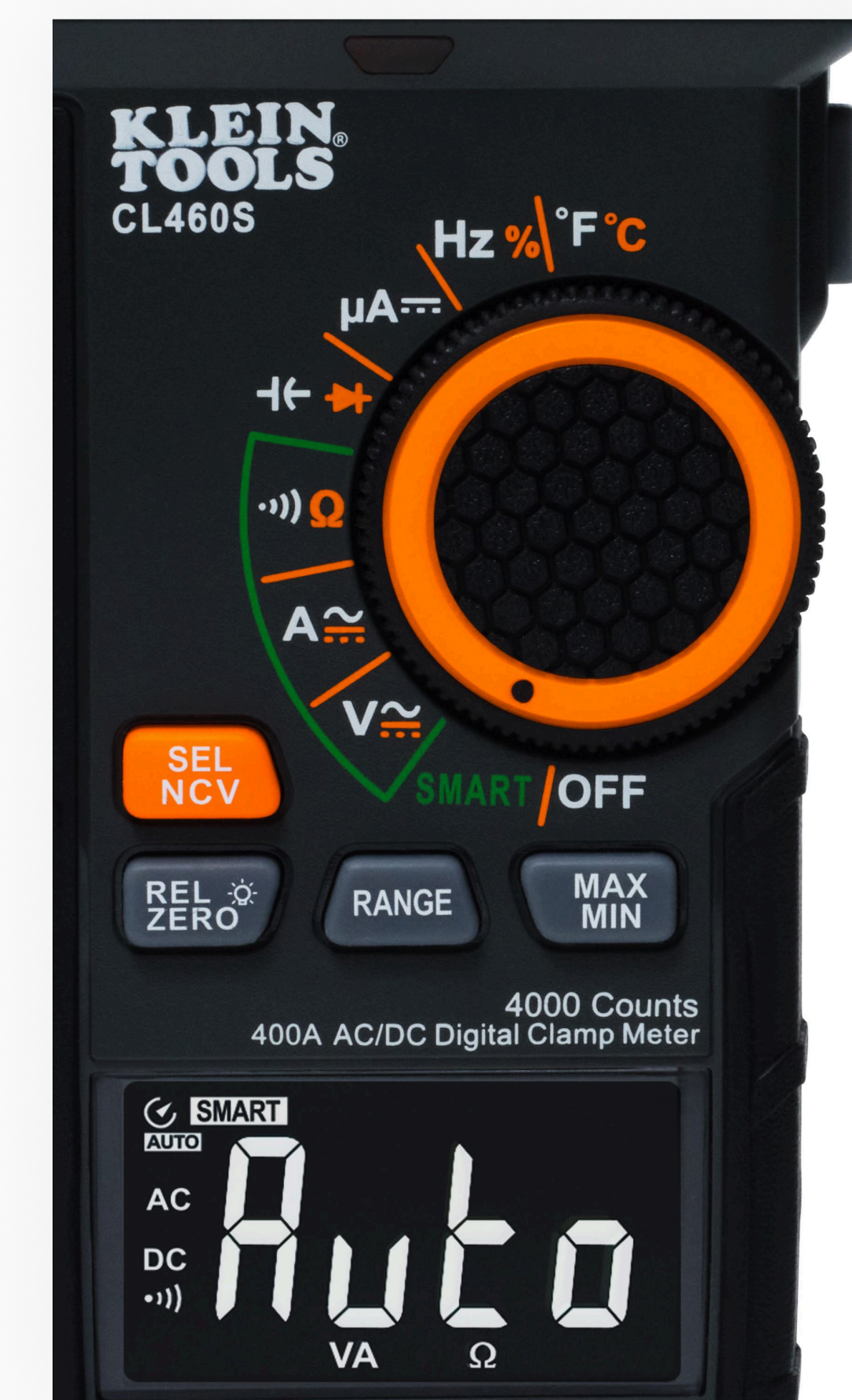
Smart Mode Automatically switches between continuity, voltage, current, and resistance